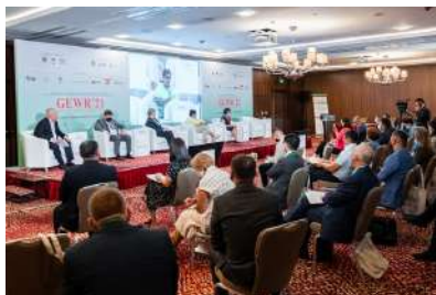
GEWR'21 500 participants online/offline format