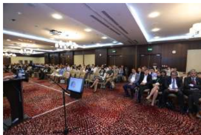
GEWR'17 270 participants 11 countries of the world