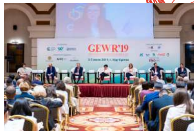
GEWR'19 280 participants 12 countries of the world