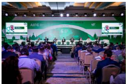
GEWR'18 300 participants 15 countries of the world