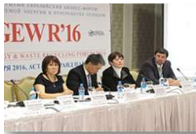
GEWR'16 120 participants 5 countries of the world